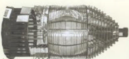
Alonzo P. Hyde

The third order Fresnel lens was lit with a French three-wick kerosene burner fueled with lard oil.